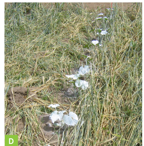
Figure 1. Four weeding protocols were evaluated: field crop farm-type mechanical weeding (A), horticultural-type mechanical weeding (B), black biodegradable mulch (C) and crimper-rolled rye mulch (D).

Kaolin was sprayed on plants to protect them from the striped cucumber beetle, hence their white-coated appearance.